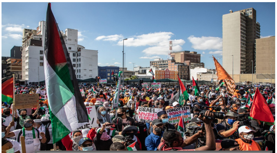
The Cape Town Pro-Palestinian March

Within an eleven-day spell of merciless airstrikes by the IDF on Gaza, 243 people (including 66 children